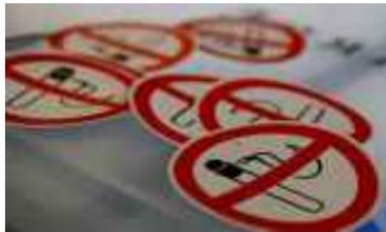
OTT platforms will be required to display anti-tobacco health spots at the beginning and middle of the programme.

"The streaming industry was not consulted be-