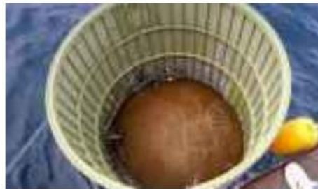
Launch residue: An object suspected to be part of North Korea's spy satellite salvaged by Seoul's military in the Yellow Sea.

After an unusually quick admission of failure, North Korea vowed to conduct a second launch after it learns what went wrong. It suggests Mr. Kim remains determined to expand his weapons arsenal and apply more pressure on Washington and Seoul while di-