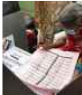
There are 3.11 crore women, 3.01 crore men and over 7,900 of the third gender.

More than 51,200 voters had changed their address, and 1 correction of entries