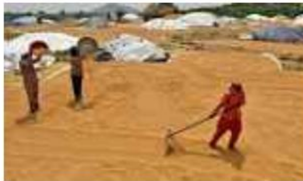
Farmers could sell their crops to PACS by receiving some advance payment at the Minimum Support Price. NAGARA GOPAL

The committee will be chaired by Cooperation and Home Minister Amit Shah. It will lay guidelines for creation of infrastructure such as godowns, for agriculture and allied purposes, at selected 'viable'