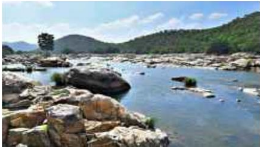
Karnataka Deputy Chief Minister D.K. Shivakumar said the State was keen on building a dam at Mekedatu, and ₹1,000 crore had been allocated for the project.

Mr. Duraimurugan said the proposal for a dam at Mekedatu, in the uncontrolled intermediate catchment, "would affect Tamil Nadu" and was "not welcome". Expressing confidence that he would be able to meet the Karnataka Minister soon, he said the issue could be discussed in detail at the meeting. He hoped Mr. Shivakumar would be patient till then.