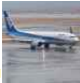
The Chennai-Tokyo direct flight was discontinued during the COVID-19 pandemic.

"The lack of direct flight connectivity more than doubles the travel time between these two destinations by about seven hours, which is significant.